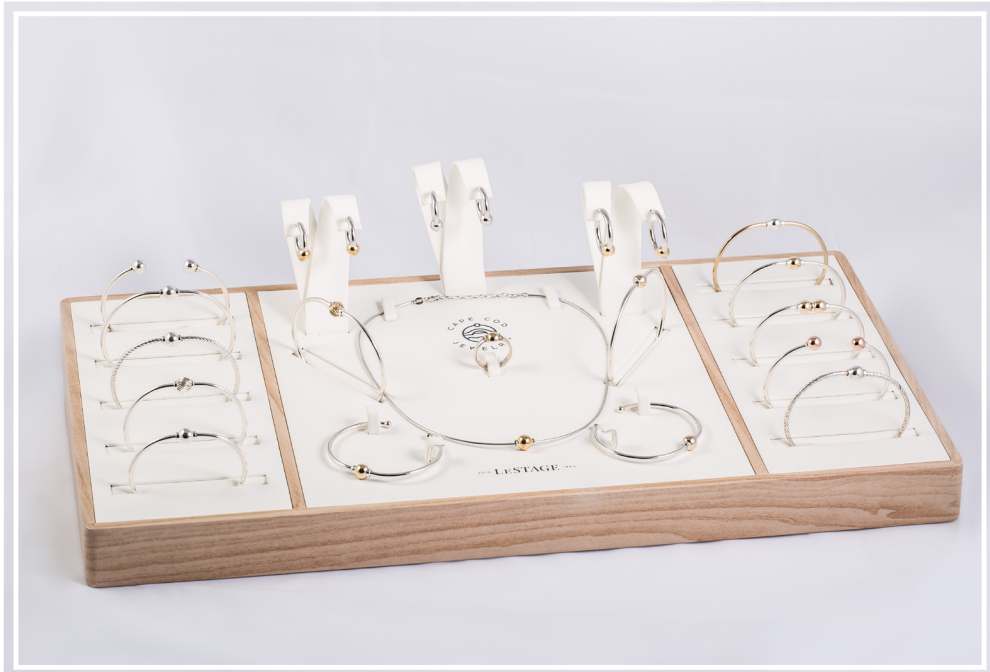
21 PIECE IN-CASE ASSORTMENT 17" X 9"

ATTRACTIVE DISPLAYS AVAILABLE WITH PROGRAM PURCHASE.