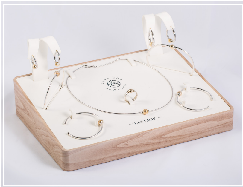
8 PIECE IN-CASE ASSORTMENT 10" X 7 1/2"

DISPLAY INCLUDES 14 BRACELETS, 5 PAIRS OF EARRINGS, NECKLACE, AND RING OF YOUR CHOICE.