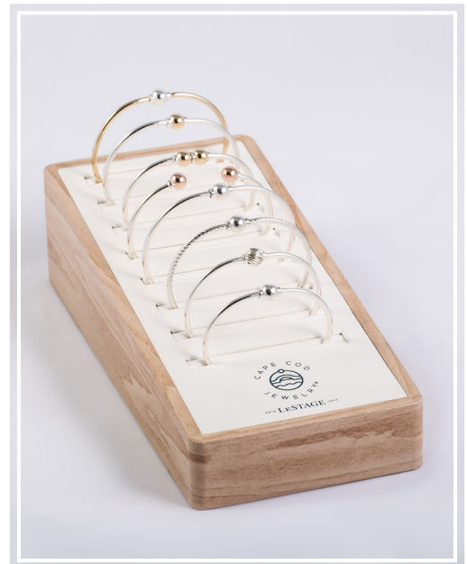
8 PIECE IN-CASE BRACELET DISPLAY 4" X 9"

DISPLAY INCLUDES 4 BRACELETS, 2 PAIRS OF EARRINGS, NECKLACE, AND RING OF YOUR CHOICE.